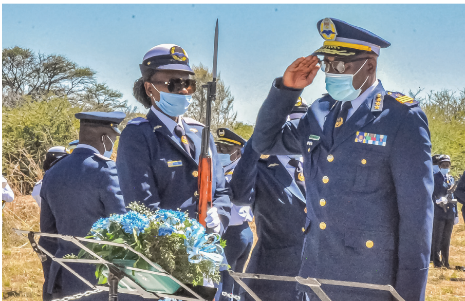
CDF laying a wreath at memorial shrine for the helicopter aircrash victims

eleven (11) uniformed members plus two (2) minors perished, are no more occurrences that evoke desolation, conjure anxiety and infuse aerophobia but, are incidences that instill vigor and determination into the air force members, to emulate the heroic deeds of their departed colleagues and keep the NAF in readiness as was a desire for the forerunners.