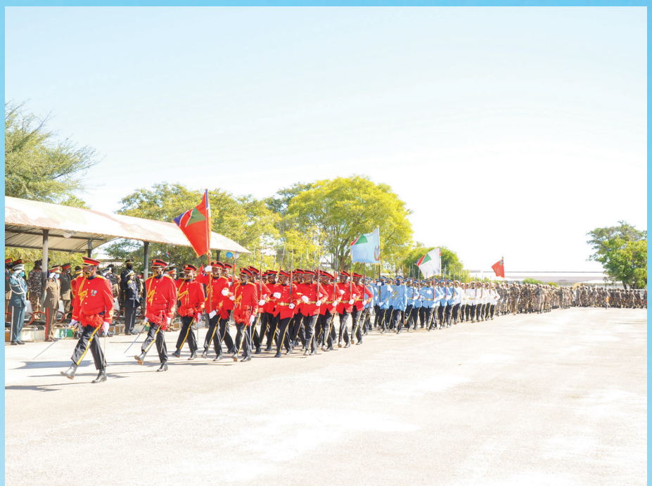
Parade comprises of all arms of service, quarter guard, brass band and colour party march - pass during the 31 st anniversary ceremony

As head of State and the Commander-In-Chief of the NDF, His Excellency Dr. Hage Geingob, it was a befitting occasion to deliver the state of defence force address, to highlight the NDF 31 years' trajectory and express his intention and desire on the force's future. However, his address did not entertain ill-behaviour nor tolerate laziness among the uniformed members.