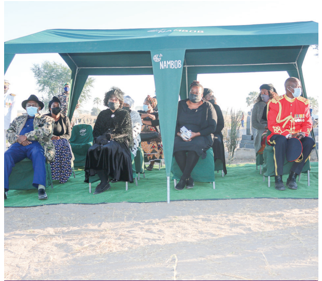
Family members and dignitaries observing burial proceedings