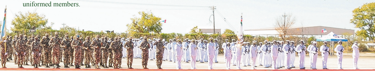
Parade forms-up in honour of NDF 31 st anniversary

His Excellency Dr. Geingob was aware of the new defence forces' roles emerging from an increasing regional conflict, whose nature, character and tone are different from conventional warfare, thereby posing new challenges to conventional armies. "As C-I-C, I am aware that the new roles and responsibilities create opportunities for the NDF to extend its role and enhance the competencies of its personnel. I am also aware that these new roles create new demands which require funding, training and retooling," Dr. Geingob said, adding that the evolving security