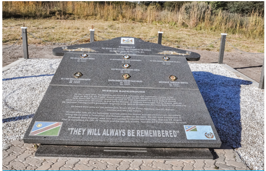
A memorial shrine erected at Grootfontein Air Base - Apron in honour of victims of the helicopter crash occurring at that premises - 11 April 2004