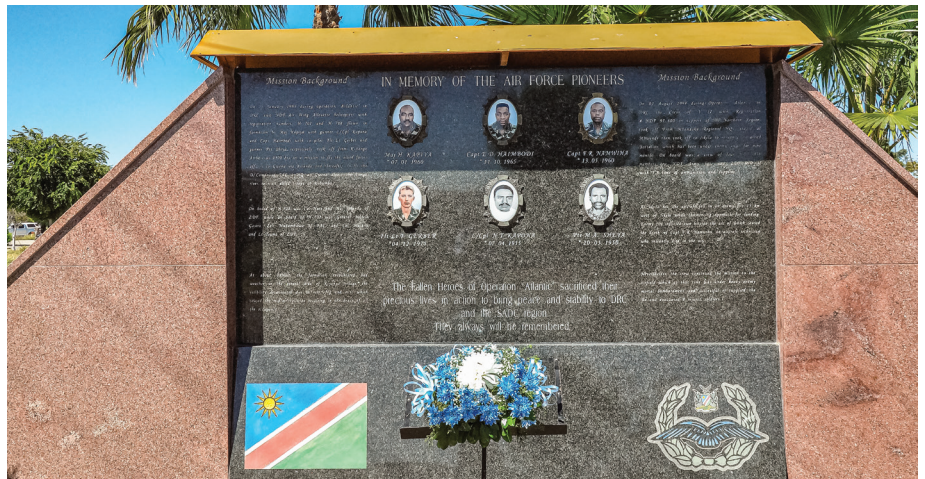
A memorial shrine honouring the DRC aircrash victims was erected in Grootfontein Air Base vicinity in ---