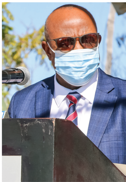
His Excellency Dr. Nangolo Mbumba delivering the Head of State” keynote address