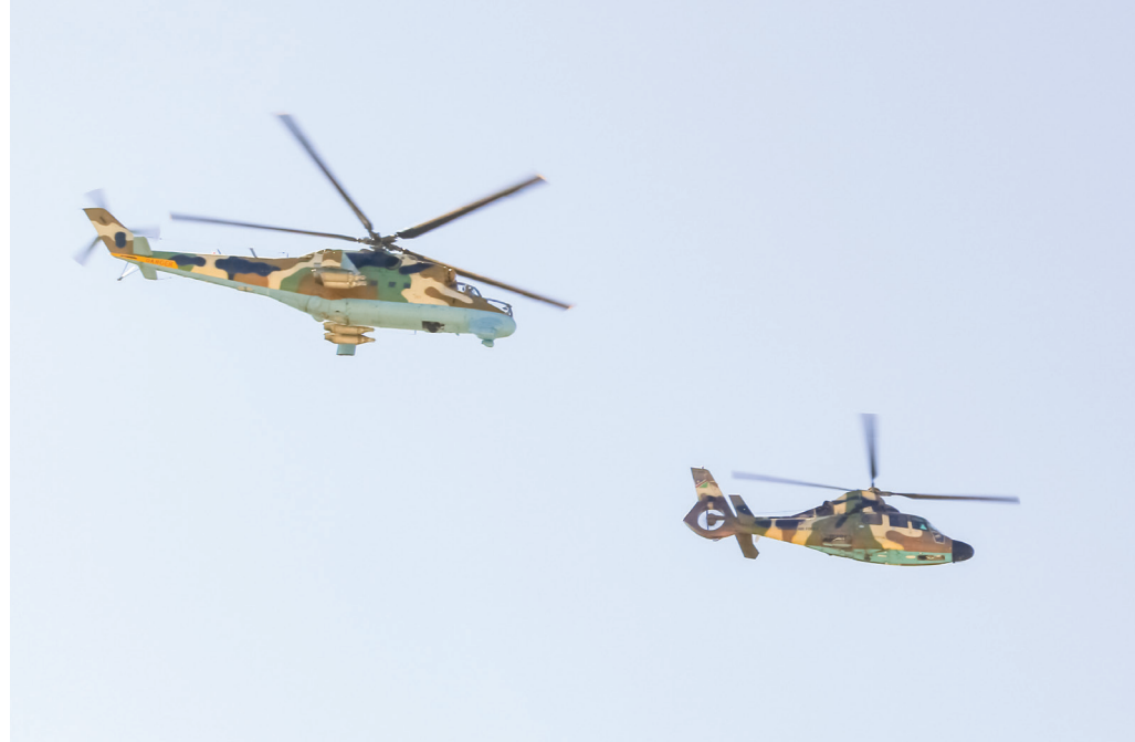
Air Force helicopters performing aerial display during in Grootfontein

His Excellency the President however commended the NDF on the assistance rendered to civil authorities in the fight against crime and other security challenges and the invaluable contribution toward the maintenance of international and regional peace