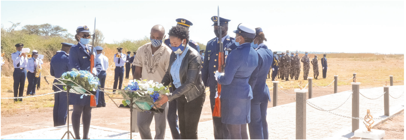
Some family members of grootfontein aircrash victims laying wreaths at the newly established shrine

The mission was to fly allied forces officers to Gwena via Kitanda and subsequently to fly the D/Commander of TAC 1 HQ at Gwena across the Congo River to visit allied troops at Kabumba.