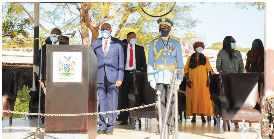
Dr. Nangolo Mbumba (blue suit) with CDF - Air Marshal Martin Pinehas and other dignitaries observing the parade march-pass

be seen as all-embracing national institution which reflects the values of the Namibian State, and to whom all Namibians regardless of region, tribe or political affiliation are beholden as a national sanctuary of safety and security,” clearly categorized that the conflict in Mozambique is not limited to that of SADC member state only but they are raging in some other countries in Africa such as in the Sahel region including rural Mali, Burkina Faso, Chad and Niger’s South West. Against this background, His Excellency Hage Geingob said the military preparedness of the NDF and the maintenance of the highest standards of professionalism among officers and soldiers is utmost